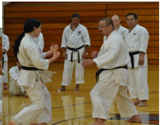
Shiina Sensei instructing Kumite